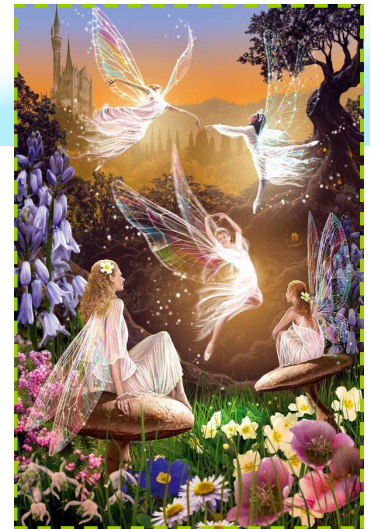
Faeries are Gathering